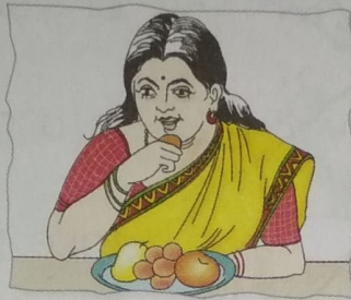
The lady is eating.