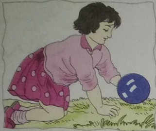
The child is playing.