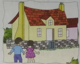
This is my house.

Now let us read the group of words given under each picture.