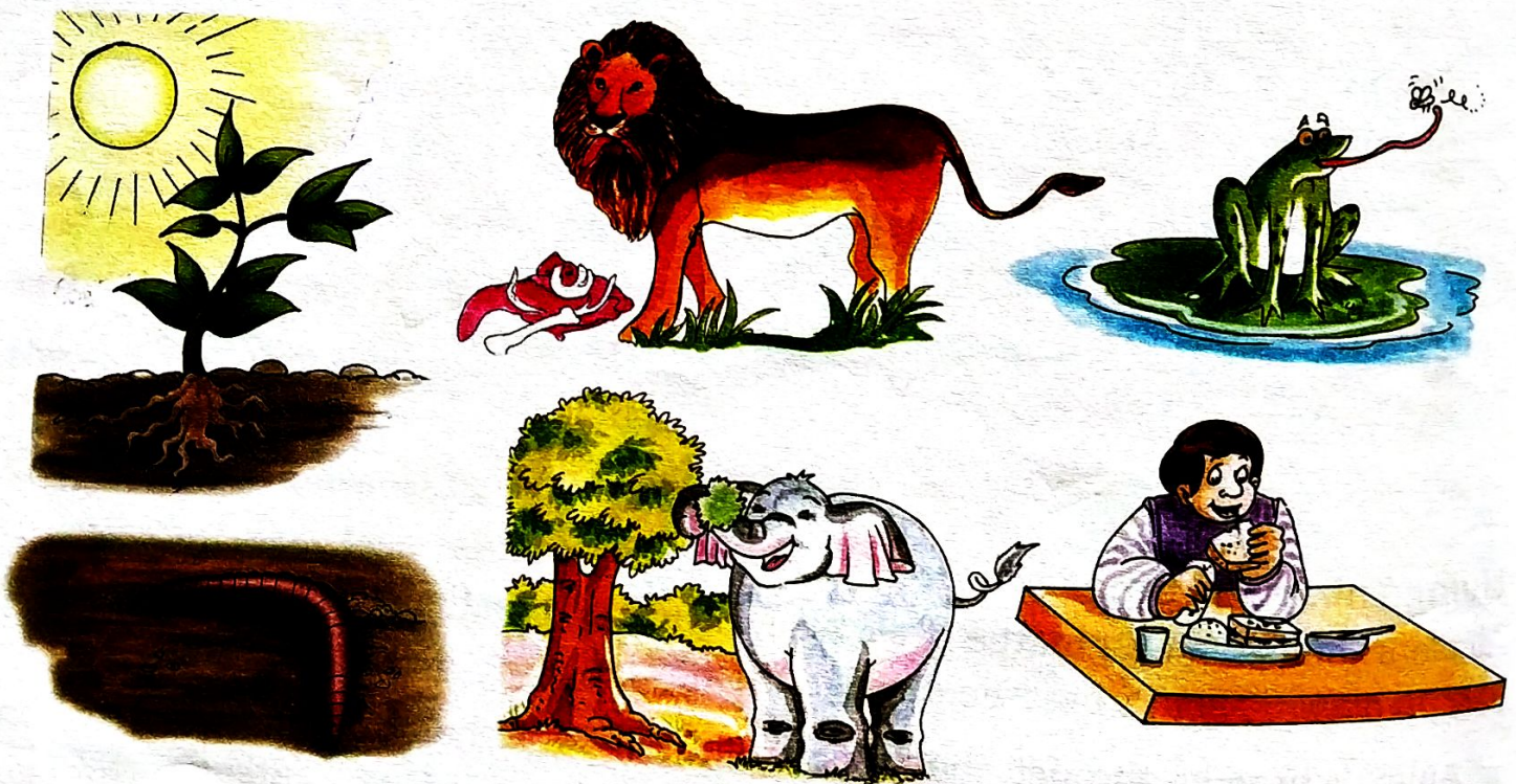
All living beings need food

Animals depend on plants for their food. Animals get their food from plants or other animals.