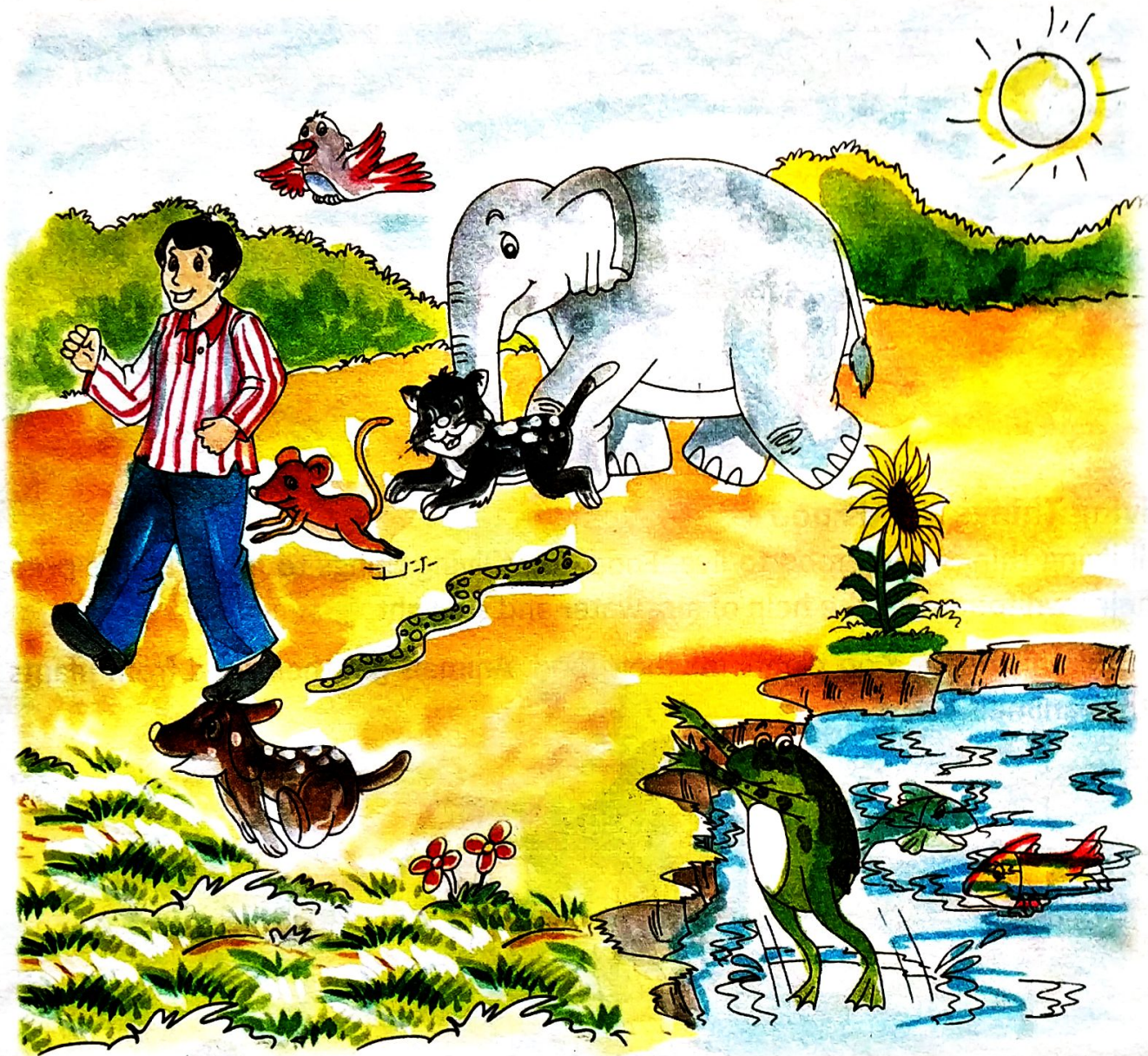
Living things move

Plants like climbers need support to climb up, creepers grow along the ground and sunflower turns its face towards the sun.