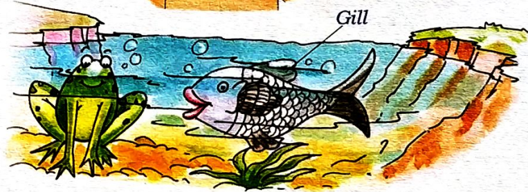
Living things breathe