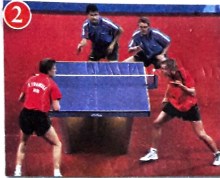
Ping Pong TABLE