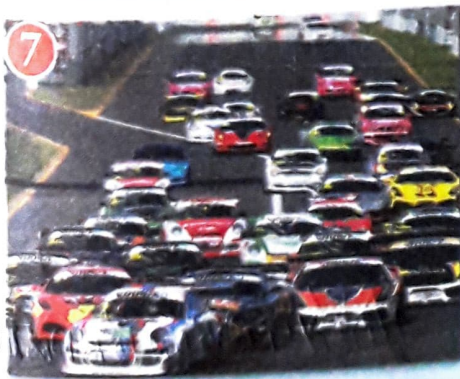
Car Racing TRACK