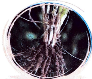
Wheat plant roots