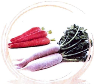
Carrot and Radish

Read these questions carefully and write the answers in the blanks.