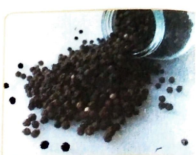
3. Black pepper